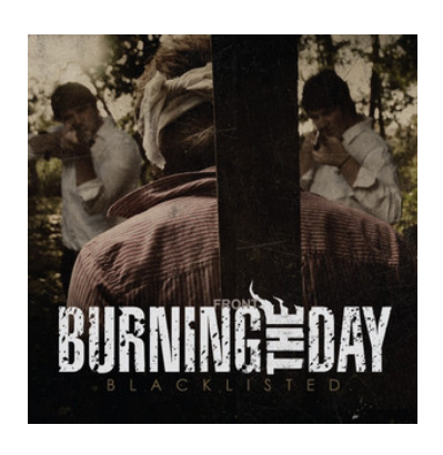
ALBUM RELEASE: TITLE: Black Listed