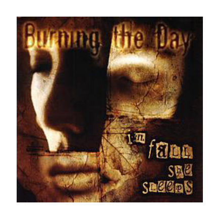
ALBUM RELEASE: Title: In Fall She Sleeps