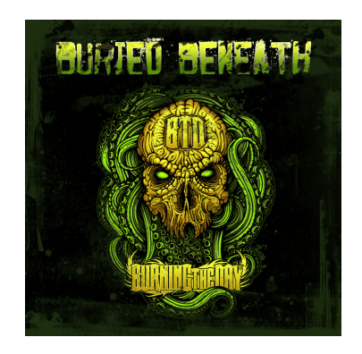
ALBUM RELEASE: TITLE: Buried Beneath

TITLE: Breakaway Europe Special Edition EP