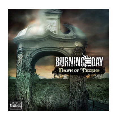
ALBUM RELEASE: TITLE: Dawn of Thorns